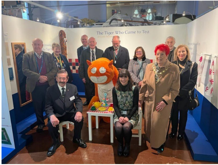
Opening event on 24 November 2023

celebrates the life and work of Judith Kerr, one of Britain's best known children's book author-illustrators.