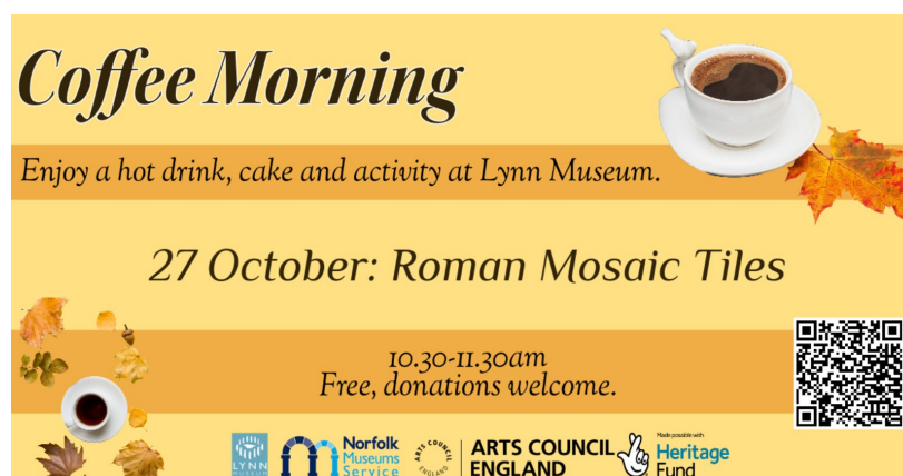
Poster for October's coffee morning at the museum

27 October Roman Mosaic Tiles (8 participants)