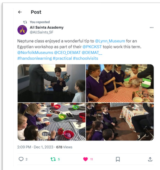
Social media post from All Saints Academy showing appreciation for a visit for a learning session about Egyptians at Lynn Museum

This following link for teachers explains what is on offer at Lynn Museum for pupils at Key Stage 2: