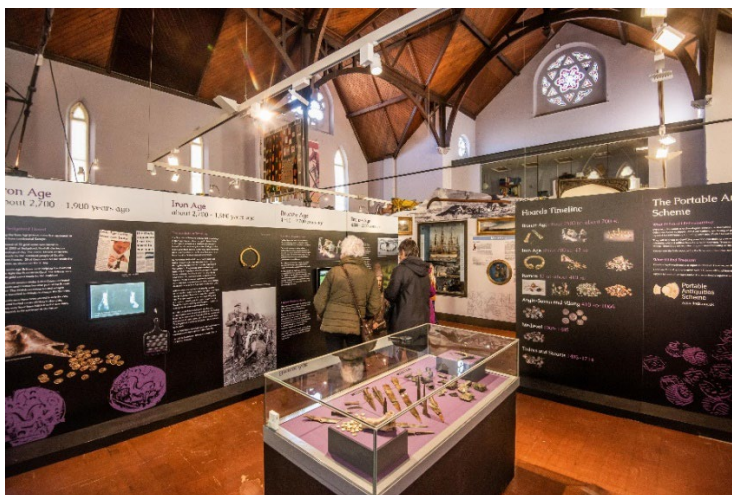
General view of the Hoards exhibition at Lynn Museum