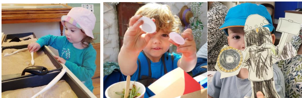
Permission from parents granted for use in this report