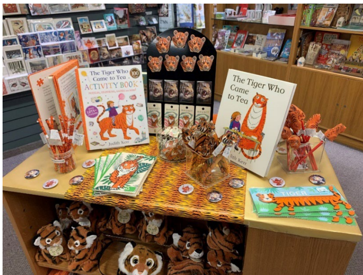
Retail display of tiger-related merchandise at Lynn Museum

Copies of Kerr's original artwork will be on display alongside notes and sketches. Children can also enjoy stepping into Sophie's kitchen to have tea with a life-size tiger. Published in 1968, Kerr's first picture book The Tiger Who Came to Tea began life as a bedtime story for her own children. It became a classic. By the 40 th anniversary in 2008, the book had 11 language translations and had sold over five million copies.