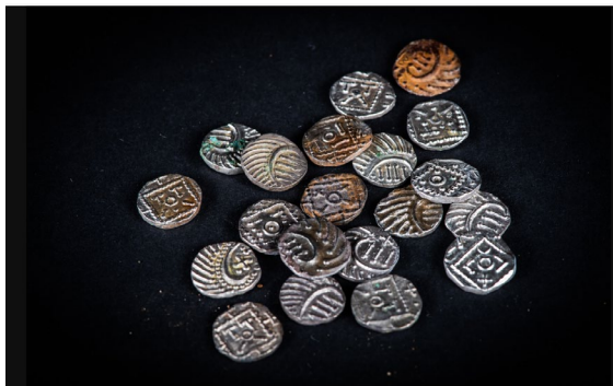
Hoard of early Anglo-Saxon coins from Fincham

The exhibition has also been an opportunity to display examples of coin hoards from the Iron Age and early medieval periods purchased in recent years with the support of the Museum Friends, the V&A/ ACE Purchase Fund, the National Lottery Heritage Fund and the Headley Trust.